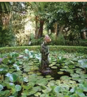
Botanical Gardens in Malaga