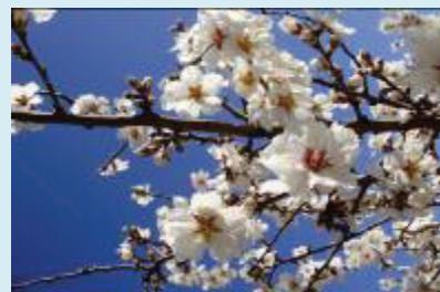
Spring has already sprung!