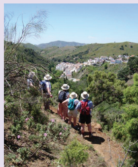
Early walk to Salares village

If you like the idea of some gentle, morning exercise with the afternoons free to relax, you might enjoy our early June level 1 walking week. Walks will depart early to avoid the heat of the day - we will enjoy a packed breakfast on the walk or have breakfast in a village. We will return in time for lunch at the Finca or in a local tapas bar. The week will include one morning coastal walk with lunch on the beach and the afternoon spent by the seaside.