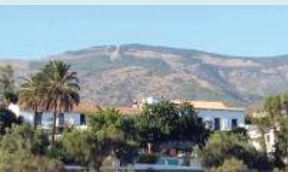
Fresh air & blue skies